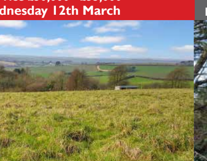
Land near St Winwolaus's Church

St. Martin, Looe | Auction Guide Price £50,000 - £55,000 For sale by public auction - Wednesday 12th March